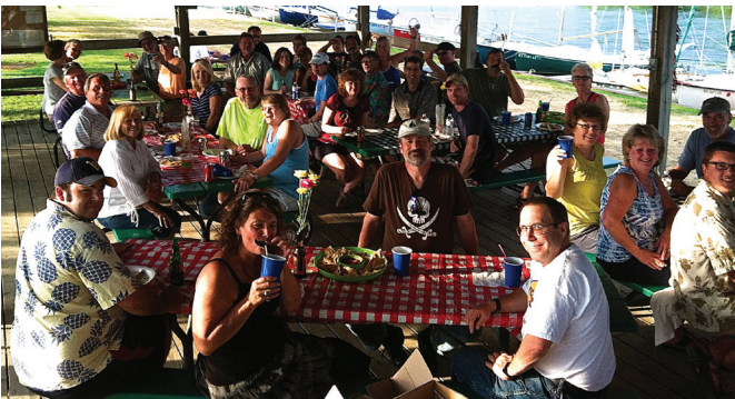
International Moonlight Dinner and Sail

Initiation Fee $50 (paid upon joining) Waiting List $50 (if you wish to be moved to another space) Active Membership $200 Group Membership $200 Associate Membership $30 (former active member)