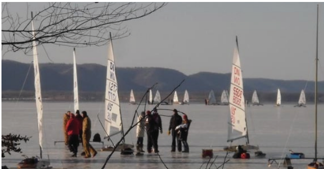
Ice Boating: when the ice is right!

Name _____ Address _____ Home Phone & Cell Phone(s) _____ Email Address _____ Length and Make of Boat _____ Type of space requested _____