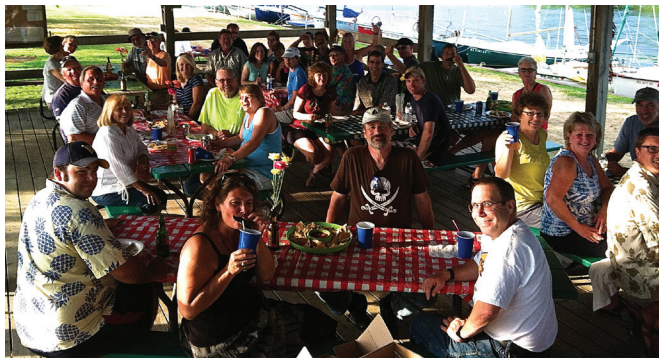
International Moonlight Dinner and Sail

Initiation Fee $50 Waiting List $50 Active Membership $145 Group Membership $190 Associate Membership $10 (former active member)