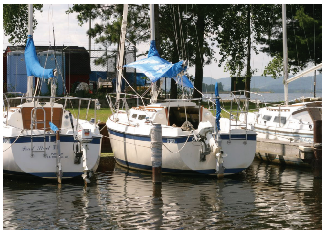
Cruiser slips at the bulkhead on a summer day--a pleasant place to be, even when there is not much wind.