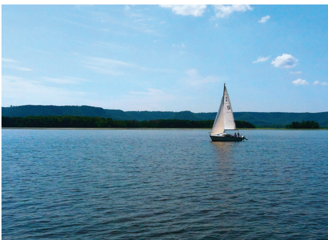
Cruising is a daily option on Lake Onalaska from April through October and sometimes into November.

Facebook page: www.facebook.com/LAXSailing