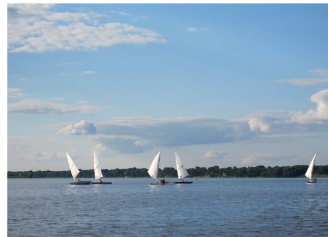
One-Design racing occurs on Tuesday evenings with Laser and Wednesdays with Daysailer fleets. Keelboats race with Portsmouth scoring on Thursday evenings.

Lock and Dam No. 7 forms Pool 7 and Lake Onalaska, located on Mississippi River mile at 702.5 near La Crescent, Minnesota. It was constructed and placed in operation in April, 1937 and underwent major rehabilitation from 1989 through 2002.