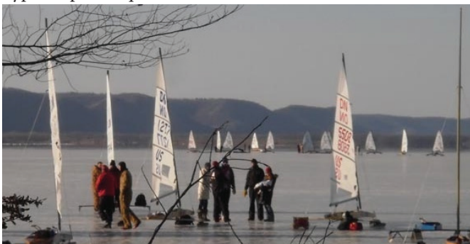
Ice Boating: when the ice is right!

Name Address Home Phone & Cell Phone(s) Email Address Length and Make of Boat Type of space requested